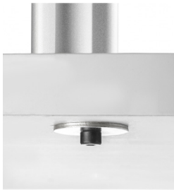
Bolt through AWM-FB

Offers flexible mounting position. Used when attachment to the edge of the desk is not possible. Suitable for desks up to 33mm.