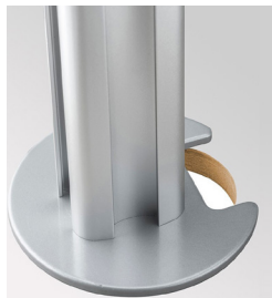
Grommet clamp AC-GC

Utilises an existing grommet hole or can be used as bolt through fixing. The plate provides extra stability for heavy loads. Fits grommet holes 60-80mm in diameter.