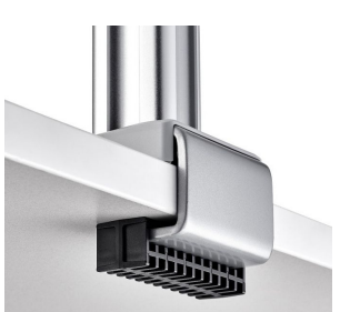
Suited to desks with potential to interfere with the elements under the desk such as cable cages. Suitable for desks up to 33mm.