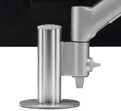
Options: AWM-LTH heavy duty tilt head AWM-LC post channel clamp

For all AWM components, add -S for silver, -B - for black and -W for white at the end of the main code.