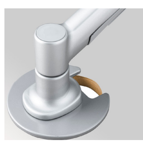
Can be used as a bolt through or grommet hole mounting option. The plate provides extra stability for heavy loads.