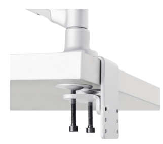
Dual steel plate design for extra strength and stability. Fits desks up to 68mm in thickness.