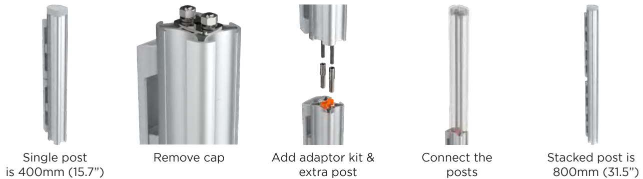
Single post is 400mm (15.7")